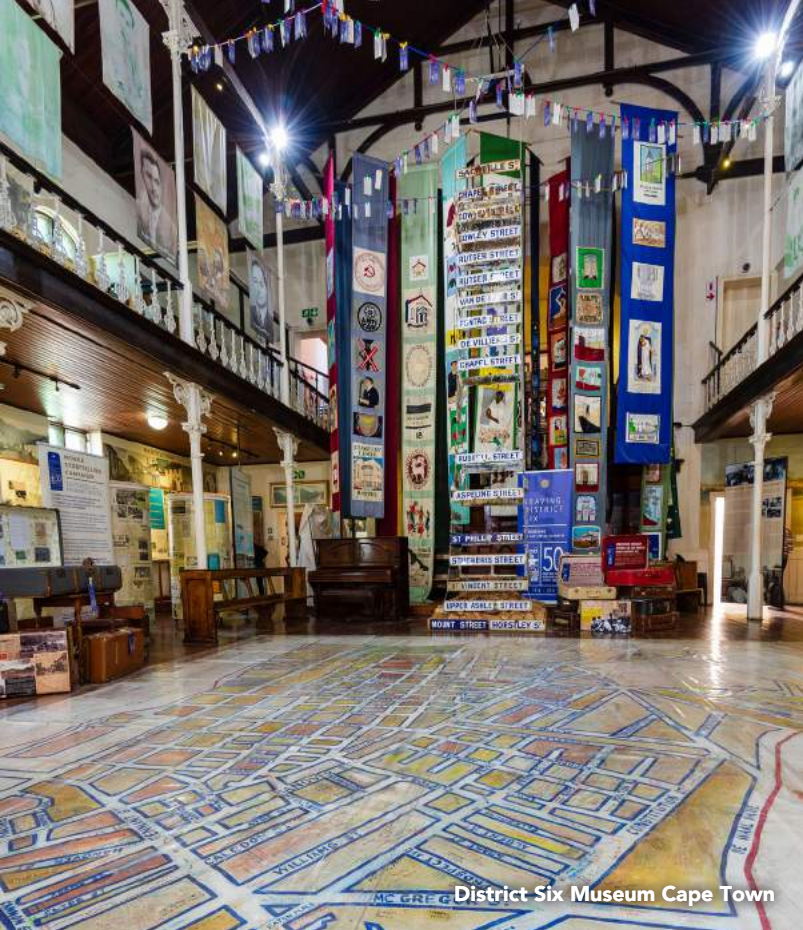
District Six Museum Cape Town

Cape Town at the District Six Museum , housed in five interconnected buildings. The museum is a powerful tribute to the communities displaced during the apartheid era.