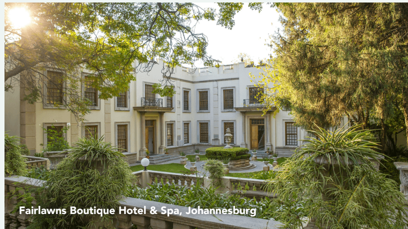
Fairlawns Boutique Hotel & Spa, Johannesburg

This boutique hotel, surrounded by lush gardens, welcomes guests with elegant rooms featuring chic furnishings and plush bedding. Indulge in rejuvenating treatments at the hotel's spa and savor exquisite dishes crafted from locally sourced ingredients at the restaurant.