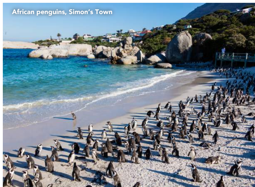
African penguins, Simon's Town

For those wanting to explore Cape Town independently, you have some options near the hotel. You may choose to make a poignant visit to the Iziko Slave Lodge , one of Cape Town's oldest buildings, where enslaved people brought to this city were housed in the 17th and 18th centuries. and the A4 Arts Foundation , a gallery space in a refurbished three-story warehouse described as a "laboratory" for art. Dinner this evening is at leisure. B,L