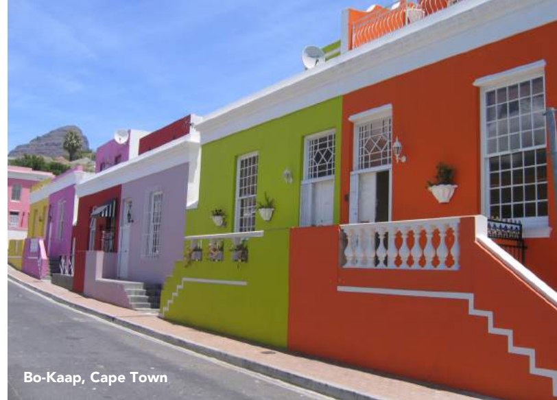
Bo-Kaap, Cape Town

Then step into the world of art and history with a behind-the-scenes tour of Ellerman House , an early 20th-century former mansion-turned-upscale hotel. Enjoy your guided look at its extraordinary private art collection spanning more than two centuries, with works exhibited throughout the property and in a dedicated contemporary gallery.