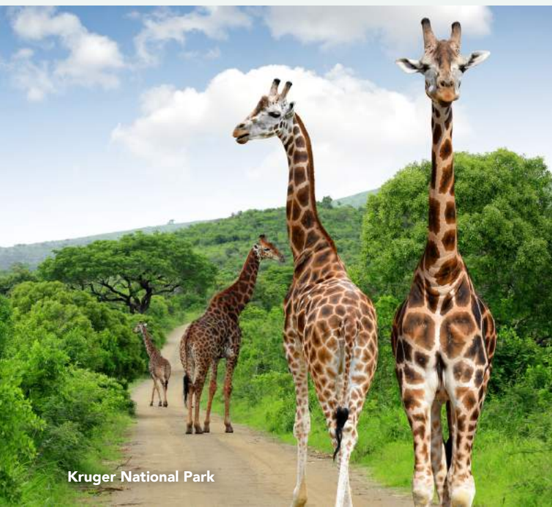
Kruger National Park

Two nights hotel accommodations at the Kapama River Lodge; all meals as indicated in the itinerary (B=Breakfast, L=Lunch, T=Tea, D=Dinner); bottled water, soft drinks, juices, and coffee/tea with all meals; one-way, economy-class internal flights (Cape Town-Hoedspruit / Hoedspruit-Johannesburg); all airport transfers with the group; escorted sightseeing, transportation, entrance fees, and all included safari excursions led by skilled rangers and trackers; taxes, service, and portage charges; gratuities to local guides and drivers.