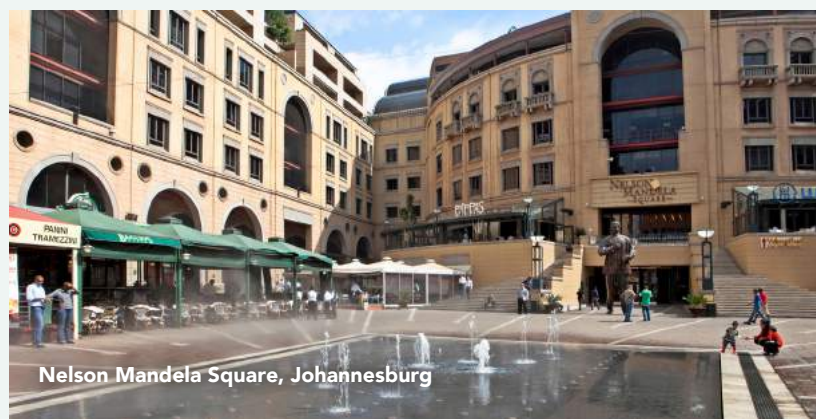
Nelson Mandela Square, Johannesburg

Two nights hotel accommodations at the as per itinerary; all meals as indicated in the itinerary (B=Breakfast, L=Lunch, D=Dinner); bottled water, soft drinks, juices, and coffee/tea with all meals; house wine at all lunches and dinners including the welcome reception; one-way, economy-class internal flight (Johannesburg-Cape Town); airport transfers; escorted sightseeing, transportation, and entrance fees for all included visits; group airport transfers for participants on the suggested flights; taxes, service, and portage charges; gratuities to local guides and drivers