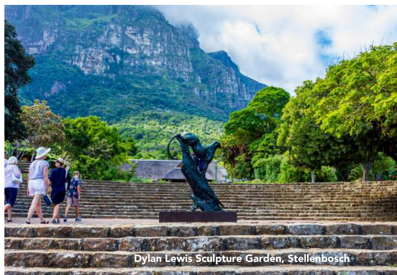
Dylan Lewis Sculpture Garden, Stellenbosch

The afternoon is yours to explore Stellenbosch at your leisure. Wander through its quaint streets, lined with oak trees and Cape Dutch architecture, or visit the Village Museum , where four historic houses showcase the town's architectural development through different eras. Gather at one of Stellenbosch's lively restaurants for a memorable dinner this evening. B,L,D