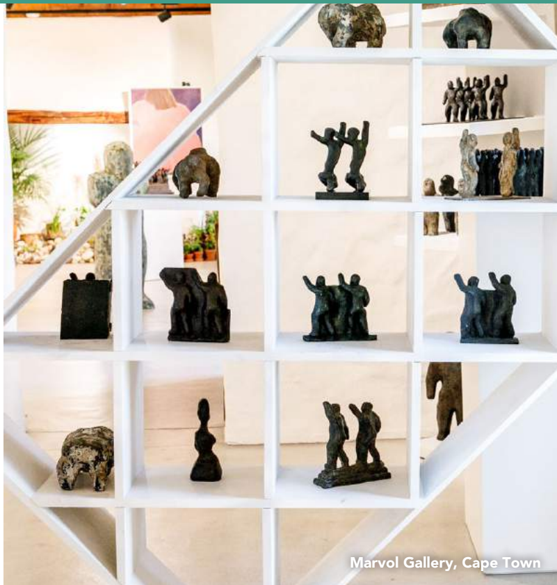
Marvol Gallery, Cape Town

An optional two-night prelude program in Johannesburg is offered from February 12-15, 2025.