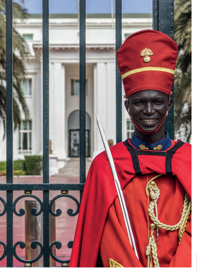
Palais Présidentiel, Dakar