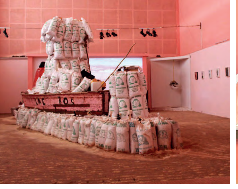
Lac Rose, Installation View at the 14th Dakar Biennale, 2022