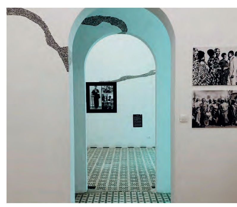
Musée de la Photographie de Saint-Louis

Upon arrival, check into the Hôtel La Résidence. Stroll through Saint-Louis's Old Town and admire the faded yet colorful grandeur of the French colonial villas with carved wooden balconies. Visit the Musée de la Photographie de Saint-Louis, Senegal's first private museum dedicated to contemporary photography. Later, visit the fisherman's community of Guet N'Dar and observe the fishermen returning with their catches against a backdrop of colorful pirogues along the water. Gather for dinner this evening. B,L,D