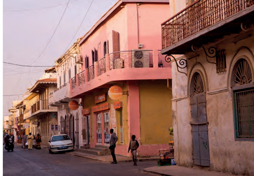
Old Town, Saint-Louis

After lunch at a local restaurant, continue your journey northwest to the UNESCO-listed town of Saint-Louis, which is set on an island near the mouth of the Senegal River. Saint-Louis was founded as a French colonial settlement in the 17th century and urbanized in the mid-19th century, later becoming