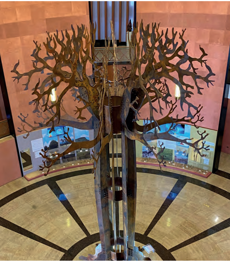
Museum of Black Civilizations, Dakar

Before heading back to the hotel, visit the Musée Théodore Monod d'Art Africain, one of West Africa's oldest art museums, established in 1938. Explore its extensive collection of West African art and objects including traditional dress, carvings, musical instruments, masks, fabrics, and tools. Gather this evening for a welcome dinner at a restaurant with dramatic views of the Atlantic Ocean. B,L,D