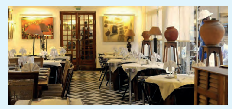
Hôtel La Résidence, Saint-Louis

In the heart of Dakar, enjoy a beachfront experience with stunning views of the private marina and ocean. The bright modern guest rooms and suites are well-equipped with various amenities, including Wi-Fi, TVs, minibars, LAVAZZA coffee machines, E-readers, and private bathrooms. The resort also features onsite restaurants serving delicious local and international cuisine, a bar, direct beach access, a swimming pool, a fitness center, a spa, a salon, and a boutique store.