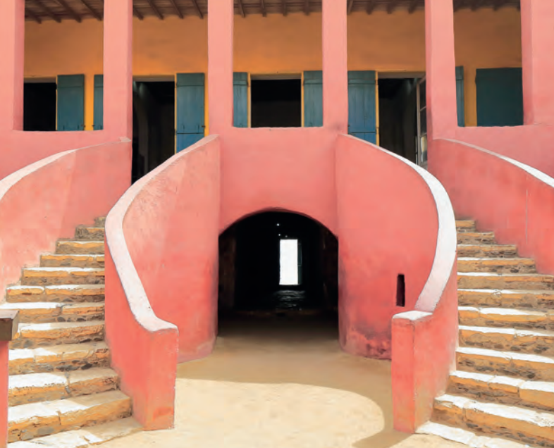
Maison des Esclaves, Gorée