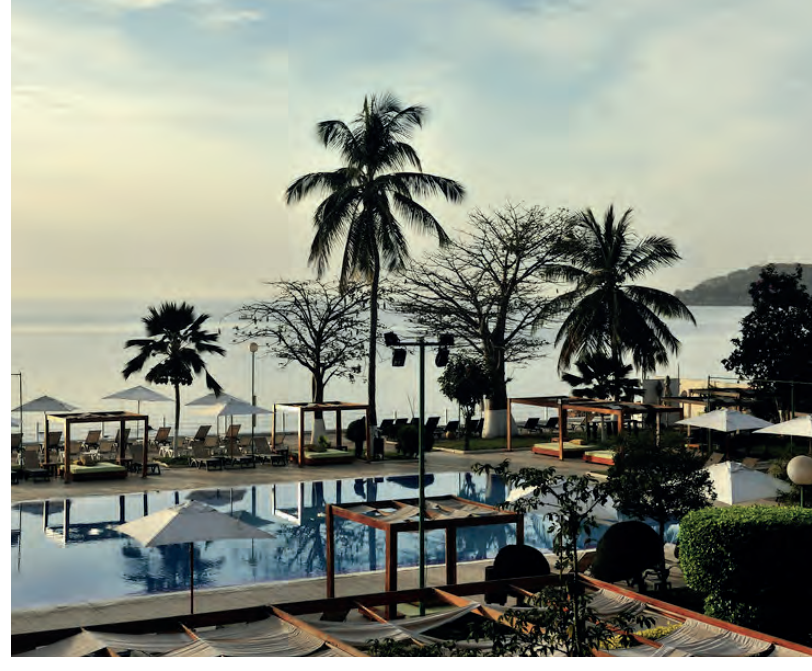
Pullman Dakar Teranga