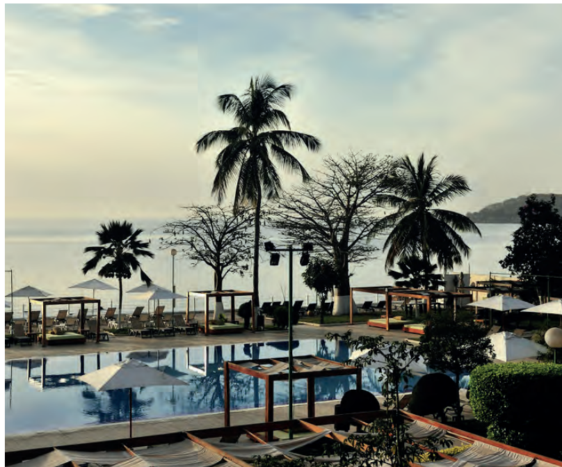
Pullman Dakar Teranga