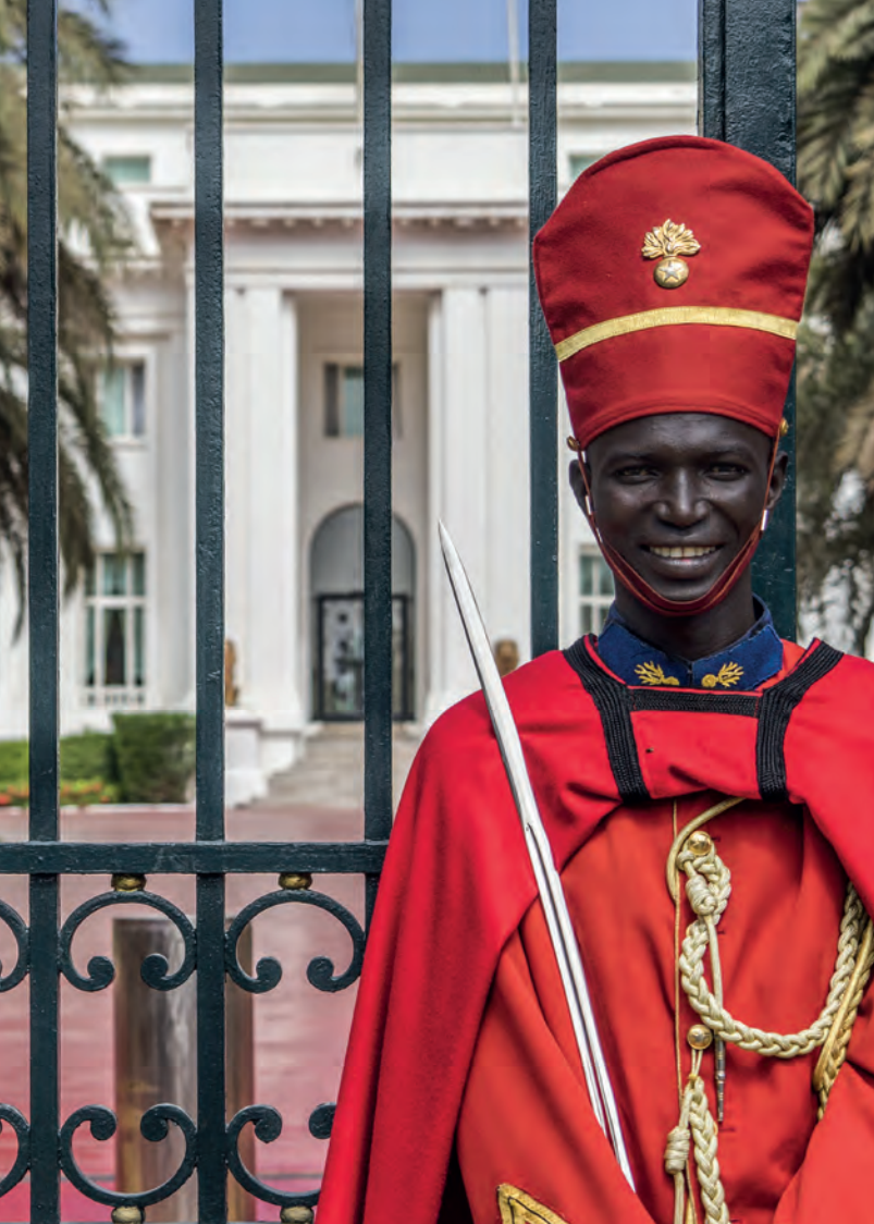
Palais Présidentiel, Dakar