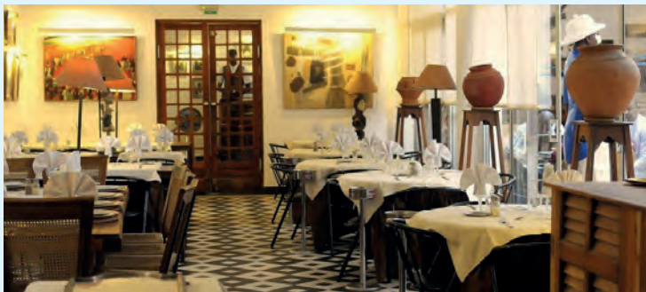
Hôtel La Résidence, Saint-Louis

In the heart of Dakar, enjoy a beachfront experience with stunning views of the private marina and ocean. The bright modern guest rooms and suites are well-equipped with various amenities, including Wi-Fi, TVs, minibars, LAVAZZA coffee machines, E-readers, and private bathrooms. The resort also features onsite restaurants serving delicious local and international cuisine, a bar, direct beach access, a swimming pool, a fitness center, a spa, a salon, and a boutique store.