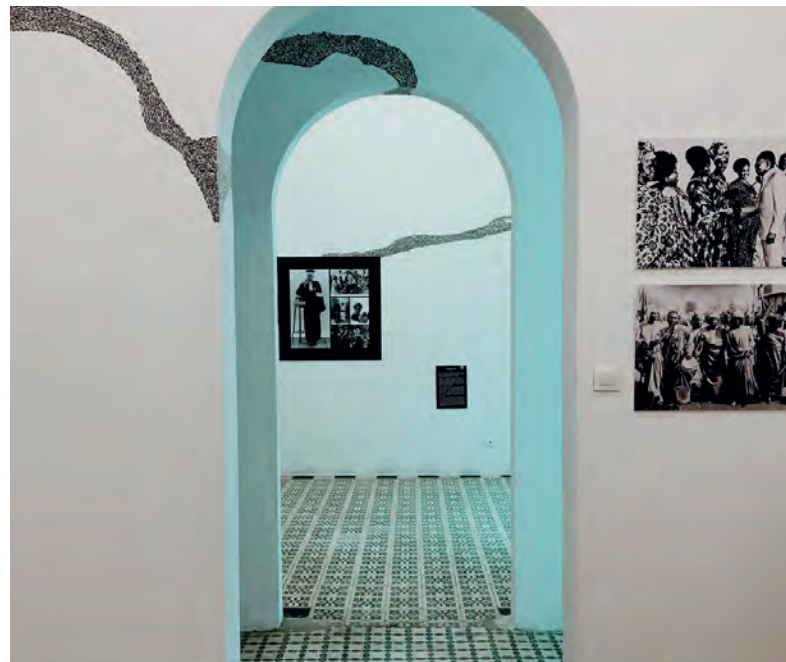
Musée de la Photographie de Saint-Louis

Upon arrival, check into the Hôtel La Résidence. Stroll through Saint-Louis's Old Town and admire the faded yet colorful grandeur of the French colonial villas with carved wooden balconies. Visit the Musée de la Photographie de Saint-Louis, Senegal's first private museum dedicated to contemporary photography. Later, visit the fisherman's community of Guet N'Dar and observe the fishermen returning with their catches against a backdrop of colorful pirogues along the water. Gather for dinner this evening. B,L,D