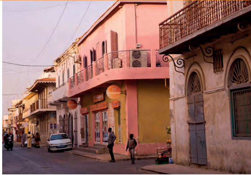
Old Town, Saint-Louis

After lunch at a local restaurant, continue your journey northwest to the UNESCO-listed town of Saint-Louis, which is set on an island near the mouth of the Senegal River. Saint-Louis was founded as a French colonial settlement in the 17th century and urbanized in the mid-19th century, later becoming