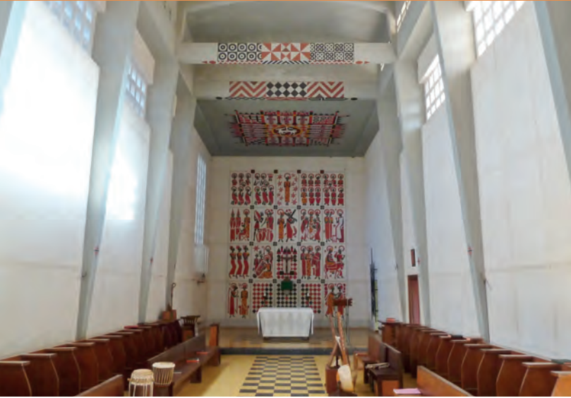
Village Des Arts, Dakar