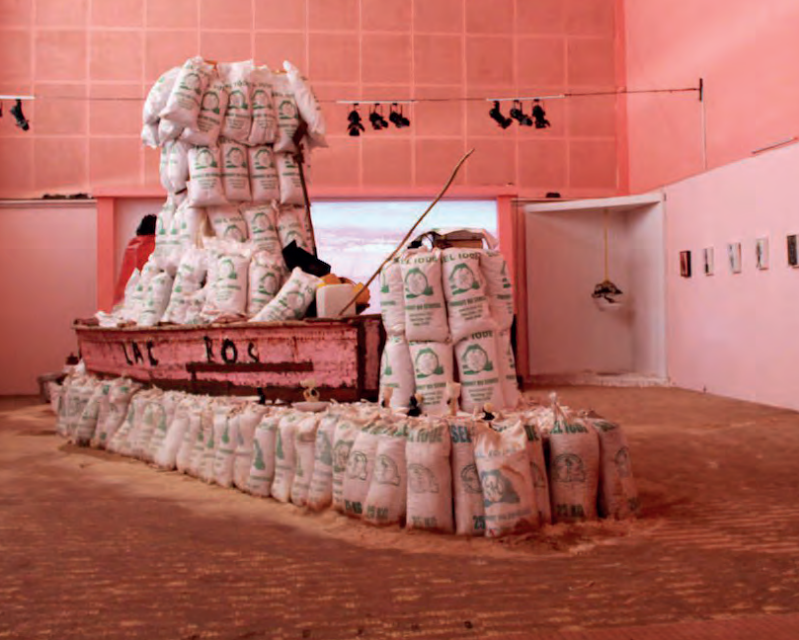
Lac Rose, Installation View at the 14th Dakar Biennale, 2022