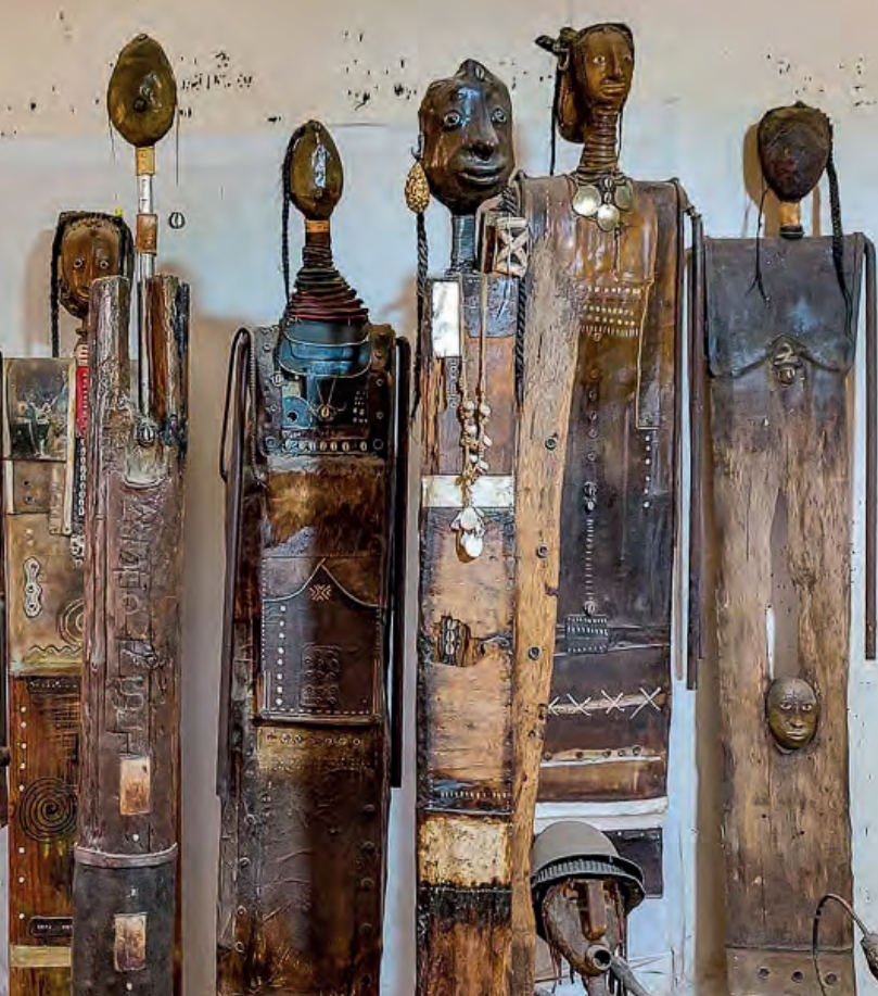
Village Des Arts, Dakar