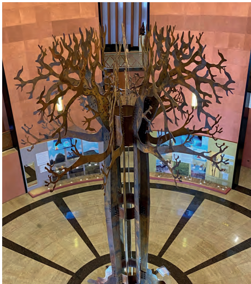
Museum of Black Civilizations, Dakar

Before heading back to the hotel, visit the Musée Théodore Monod d'Art Africain, one of West Africa's oldest art museums, established in 1938. Explore its extensive collection of West African art and objects including traditional dress, carvings, musical instruments, masks, fabrics, and tools. Gather this evening for a welcome dinner at a restaurant with dramatic views of the Atlantic Ocean. B,L,D