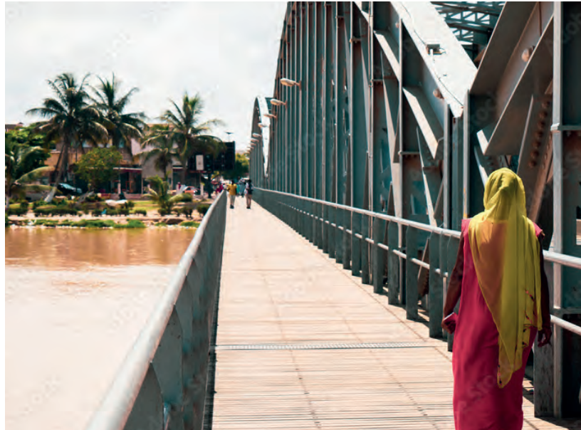
Faidherbe Bridge, Saint-Louis

After breakfast, transfer to the Dakar airport for your flight home this evening. B