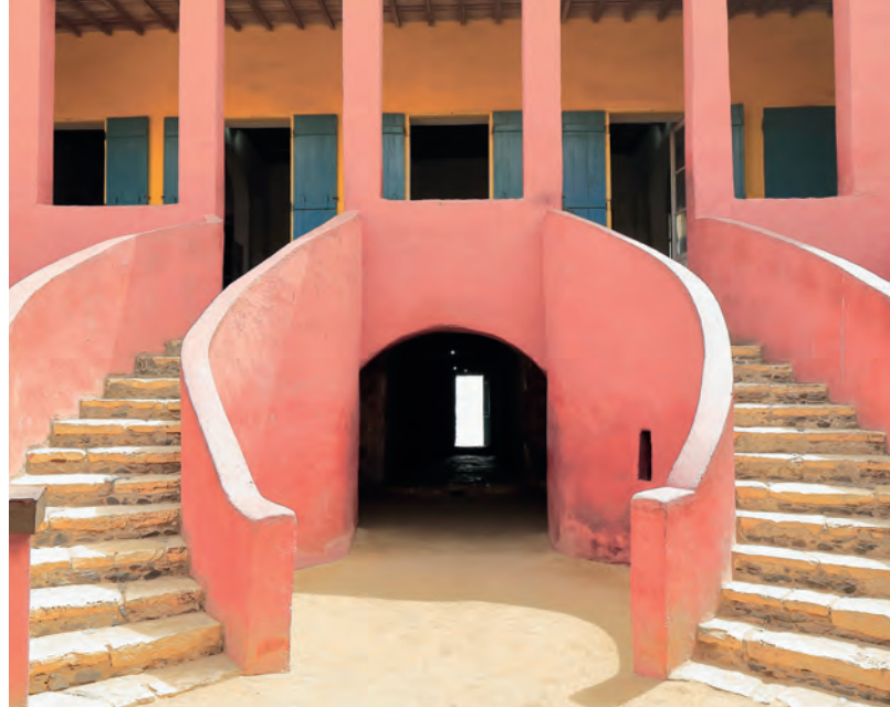
Maison des Esclaves, Gorée