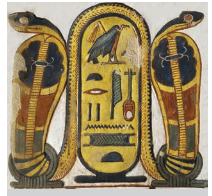
The cartouche that identifies Nefertari is protected by winged serpents.

Queen Nefertari's Egypt features objects from the New Kingdom of ancient Egypt. The exhibition includes sculpture, jewelry, musical instruments, painted coffins, religious objects, and artists' tools used over 3000 years ago. The objects bring to life the fascinating history and culture of ancient Egypt, with a focus on the lives of women during the New Kingdom period. Objects excavated from Deir el-Medina, home to artisans who built and decorated royal tombs, illuminate the daily lives and religious practices of the craftspeople and their families who lived, died, and were buried there. These exceptional objects are drawn from the collection of the Museo Egizio in Turin, Italy, which holds one of the most important collections of ancient Egyptian art outside of Cairo.