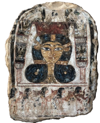
IMAGE 10 Stela with the Face of the Goddess Hathor, unknown provenance, New Kingdom, 19th dynasty (about 1292–1190 BCE), painted limestone, Museo Egizio, Turin, Italy