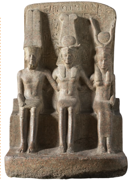
IMAGE 9 Statue of Ramesses II, Seated between the God Amun and the Goddess Mut, Temple of Amun, Karnak, New Kingdom, 19th dynasty, reign of Ramesses II (c. 1279–1213 BCE), granite, Museo Egizio, Turin, Italy