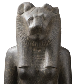
IMAGE 11 Statue of the Goddess Sekhmet, Temple of Amun, Karnak, New Kingdom, 18th dynasty, reign of Amenhotep III (about 1390–1353 BCE), grandodiorite, Museo Egizio, Turin, Italy