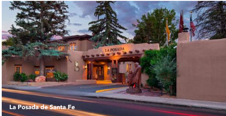
La Posada de Santa Fe

Set on six beautifully landscaped acres just steps from the historic Plaza, La Posada is the only resort in downtown Santa Fe. Authentic adobe-style architecture, distinctive accommodations, award-winning service, tranquil spa escapes, culinary discoveries, and a subtle sense of Southwestern magic and charm come together to create the ultimate New Mexico getaway.