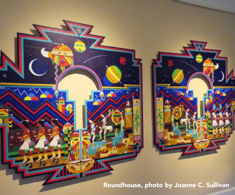
Roundhouse