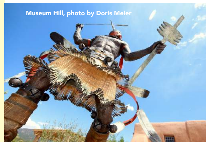
Museum Hill