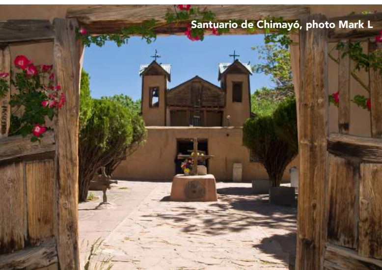
Santuario de Chimayó

DISCLAIMER: The itinerary is subject to change at the discretion of the Museum Travel Alliance and Arrangements Abroad. For complete details, please carefully read the terms and conditions at https://museumtravelalliance.com/faq.php