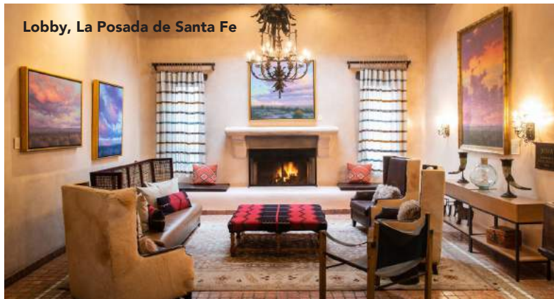
Lobby, La Posada de Santa Fe