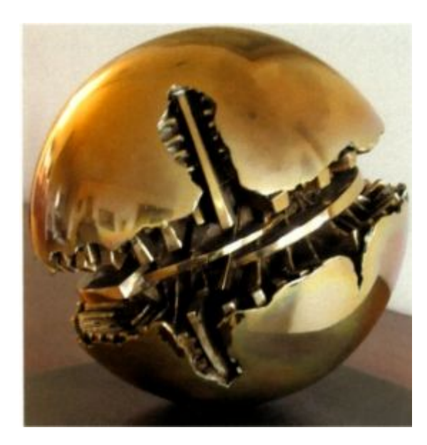
Sfera (Sphere), 1996