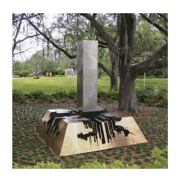
Una Battaglia (A Battle: For the Resistance Fighters), 1971