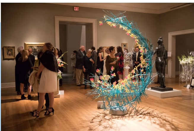
Art in Bloom 2017

On top of all this outpouring of beauty and fun, Saks Fifth Avenue's fashion show in the Pavilion of the Two Sisters, featuring airy summer frocks, was a complete hit with appreciative onlookers.