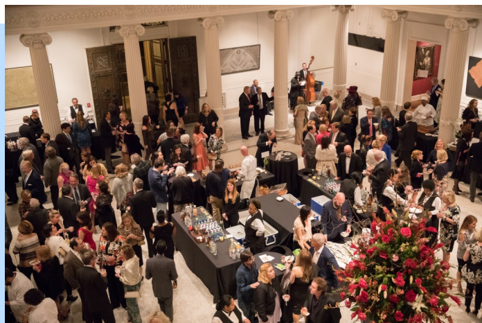
Art in Bloom 2017