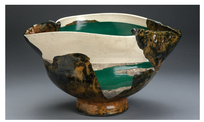
Wayne Higby, "Green Water Afternoon" Bowl, 1992, © Wayne Higby