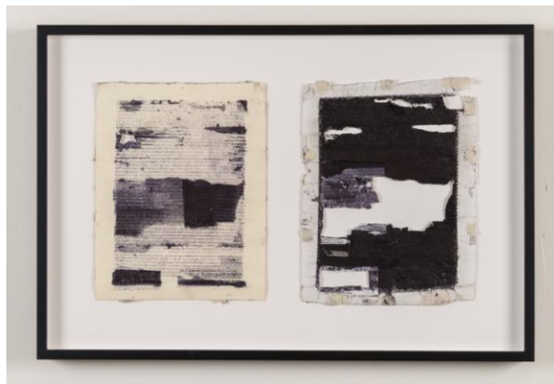
Tom Wolfe's The Right Stuff , 352 pages typed on an Underwood 21, Lancaster, CA, August-October 2013