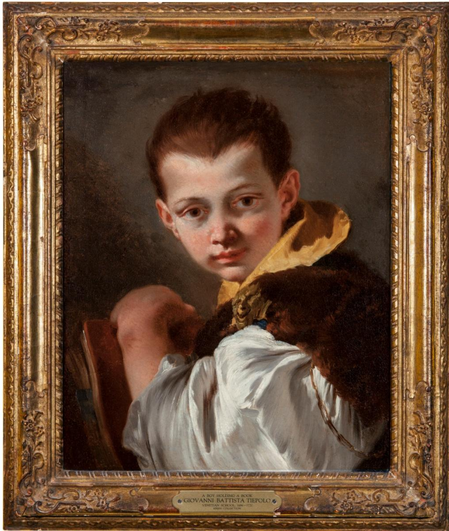
A BOY HOLDING A BOOK GIOVANNI BATTISTA TIEPOLO VENETIAN SCHOOL, 1686-1728 MUSEO CA' CORNER