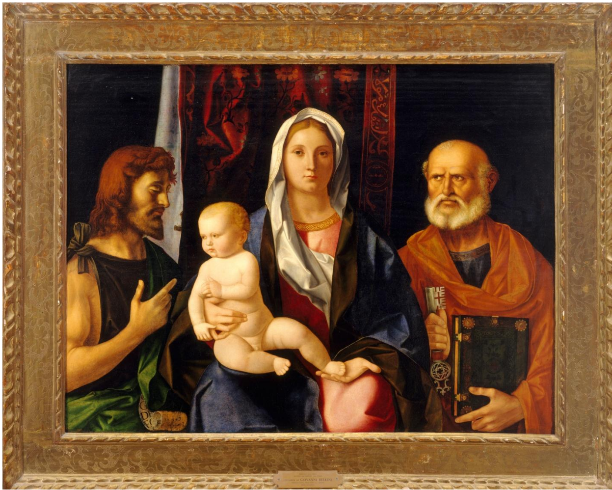
by GIOVANNI BELLINI