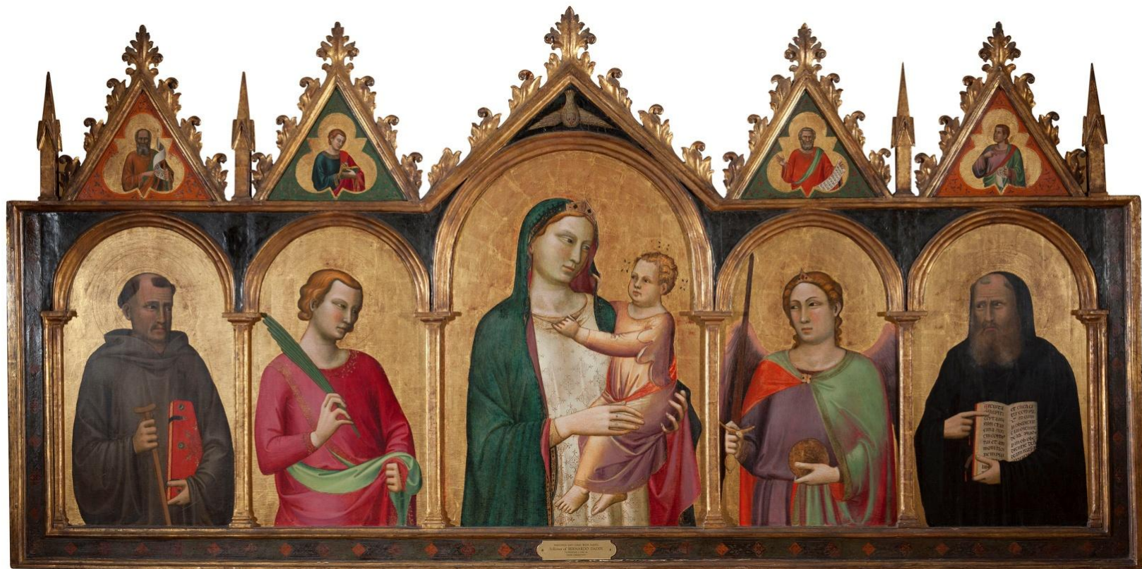
Bernardo Daddi, Madonna Lattante con i Santi, 1380-1390, Museo di Arte e Storia, Palazzo Strozzi, Firenze.